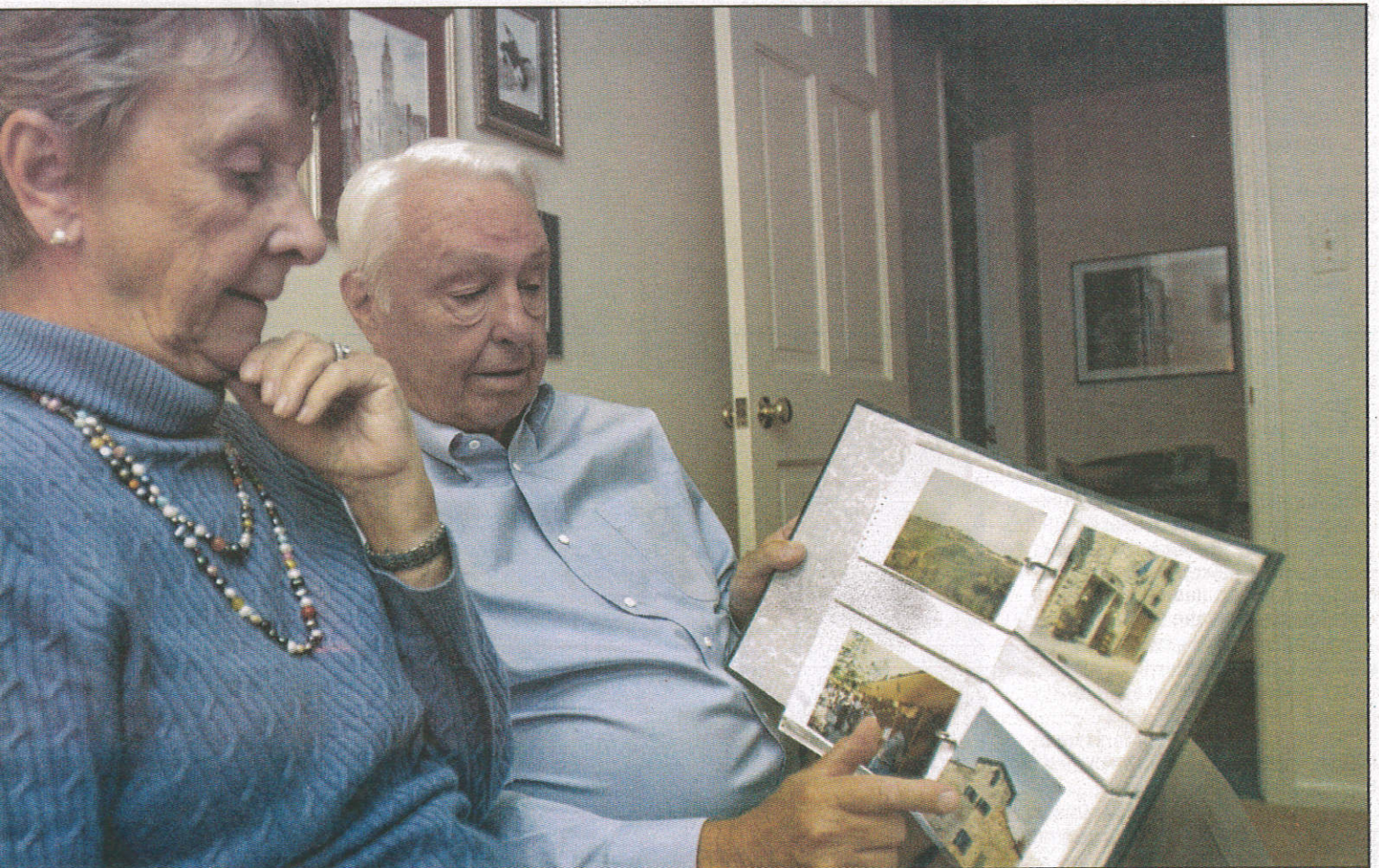
More reminisce about the sights and experiences they had during a trip to Tuscany, Italy, while looking through their photo album.